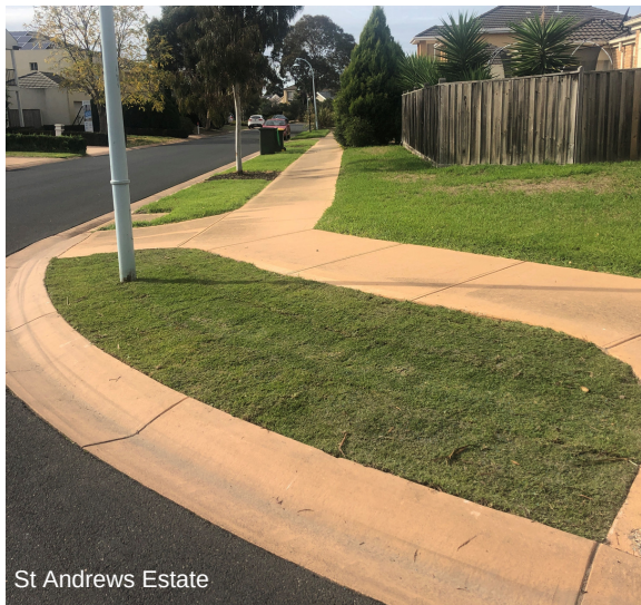
St Andrews Estate