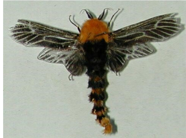
Male Saunders Case Moth

At the end of the two years, if it's possible to imagine, is where things get much weirder in the Saunders Case Moth's family life cycle. The fully-grown larvae of both sexes pupate head-downwards within the cocoon. If the caterpillar is male it will morph into something that resembles a fuzzy pipe cleaner which has sprouted wings and as such, will cut his way out of the cocoon sack to search for a female. Males are about 2.5– 3.0 cm long with a wingspan of about 4–5 cm.