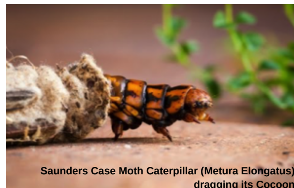
Saunders Case Moth Caterpillar ( Metura Elongatus ) dragging its Cocoon

Besides its natural camouflage, the strong woven silk cocoon's sacks are a fortress that can defy the bills and beaks of most insectivorous birds and seldom can a bird gain a tasty morsel by battering and hammering the tough malleable cocoon sack.