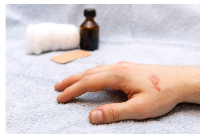
How to prevent and treat minor burns.