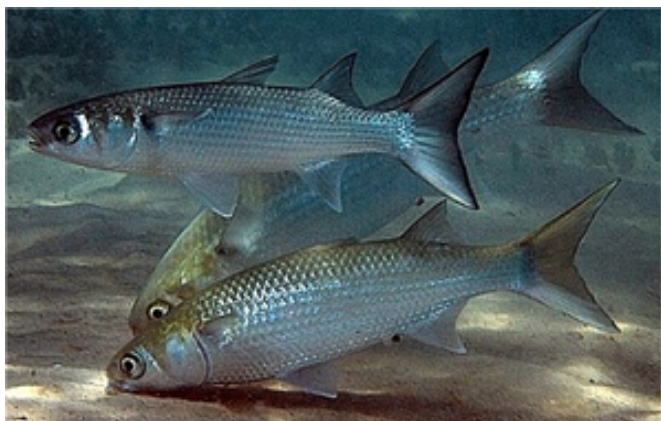
Yellow-eye Mullet ( Aldrichetta forsteri )

As you watch the Pelican's bills gobbling their fresh sea food marinara, remember the Australian Pelican has been recorded as having the longest bill of any living bird in the world. That's one for the trivia notebook.