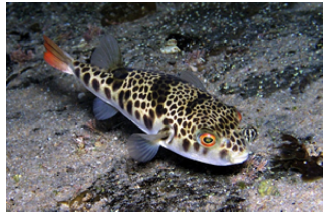
Smooth Toad Fish ( Tetractenos glaber )

Smooth Toadfish adults grow to 16 cm long with distinctive leopard-like dark markings on their dorsal side with a rounded front that tapers to a narrow tail at the back. Unlike most Puffer Fish, it does not have prominent spines on its body, but like other Puffer Fish, it can inflate itself with water or air. It forages for its preferred foods—molluscs and crustaceans—in the sand and mud of the bottom sediment. But BEWARE, the Smooth Toadfish like all Puffer Fish is highly poisonous. An unwanted catch by anglers is extremely dangerous even to touch and eating it, can result in death.