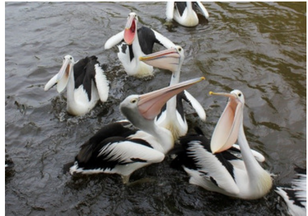
Australian Pelican ( Pelecanus conspicillatus )

The Australian Pelican may feed alone, but they seem to enjoy feeding as a cooperative group, working together, driving the prey into a concentrated mass by using their bills and beating their wings. Surrounding them in ever decreasing circles, and herding them into shallow waters.