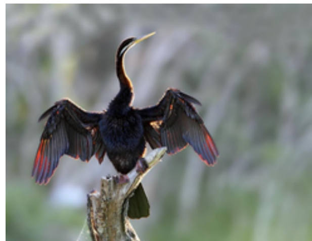
Darter or Snake Necked Cormorant Anhinga novaehollandiae

There is something about old Snake Neck that reminds me of Mediterranean fisherfolk. They both go out at dawn and get their fishing done, then head to shore, the fishermen to gossip, mend their nets, and bask in the sun. Likewise Snake Necks alight to a branch above the lake, turn to the bright morning sun, hang their wings out to dry and contemplate the world.