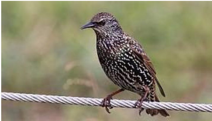
Common Starling Sturnus Vulgaris in its autumn and winter colours

The Common Starling ( Sturnus Vulgaris ) is an introduced species. The early settlers in Victoria cleared the bush but found their newly planted crops were being invaded by hordes of caterpillars and other insects. Native birds were not habituated to living in close proximity to humans so it was decided to introduce the Common Starling from Europe to consume the insect pests destroying the new farm crops. The first Starlings arrived in Melbourne in 1857. Early settlers looked forward to their arrival, believing that Common Starlings were also important for the pollination of flax, a major agricultural product at that time. Nest-boxes for the newly released birds were placed on farms and near crops. By the 1880s, established populations were present in the southeast of the country thanks mainly to the work of acclimatisation committees. By the 1920s, with very few predators, the Common Starlings were quickly becoming widespread throughout Victoria, but by then, they were also starting to be considered pests.