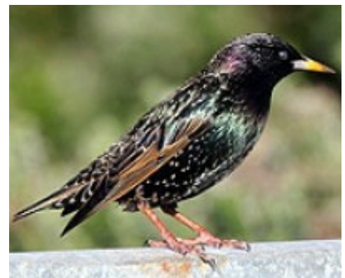
Common Starling in breeding colours, yellow beak and pink legs

So, if you are wondering along the Southern Boulevard and hear from out of the grassy strips, a Common Starling whistling the opening phrase to "Eine Kleiner Nachtmusik" you will know without a doubt, his ancestor's lineage.