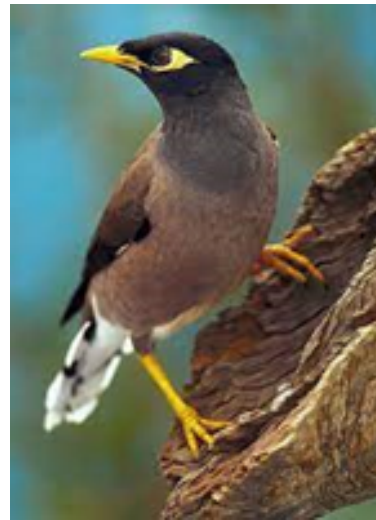
Indian Myna (Acridotheres tristis)

They are from completely different bird species. The Noisy Minor hails from the Honeyeater family, while the Indian or Common Myna is a member of the Sturnidae/Starling family.