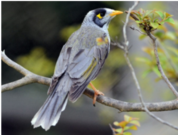
Noisy Miner (Manorina melanocephala)

One, the Noisy Miner is a native Australian Bird, the other as the name suggests, is an introduced Asian Bird, the Indian Myna.