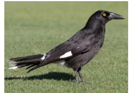
Pied Currawong Strepera graculina

The Pied Currawong is an Australian native. A large (50cm), mostly black bird, with a bright yellow eye. Small patches of white are confined to the under tail, the tips and bases of the tail feathers and a small patch towards the tip of each wing. It is often mistakenly confused with the Raven or Magpie. Currawong has nowhere near the number of white patches as a Magpie and has much shorter legs. They are similar in size and plumage to Ravens, but they are slimmer and have much larger and stronger bills. But what makes them readily distinguishable from Magpies and Ravens is their comical flight style in amongst foliage, appearing to almost fall about from branch to branch as if they were inept flyers.