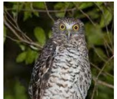
Powerful Owl Ninox strenua

Locally I observed my first Powerful Owl at the Werribee Treatment farm and then last year at the Point Cook homestead. Although over the last couple of weeks I have heard around the Estate the distinctive Powerful Owl call, I have yet to see it physically. This is mainly due to the early morning winter sun not being strong enough to lighten the upper canopy of their favourite Gum Trees. Deakin's University who have attached tracking devices to the Powerful Owl are following their movements around Victoria and they confirm that they are visiting our area. One of the unusual discoveries from Deacon's study is that Powerful Owls in suburban areas enjoy visiting Golf Courses particularly those with fresh water ponds and creeks. I would say Sanctuary Lakes Golf Course fits the Powerful Owls lodging requirements quite adequately.