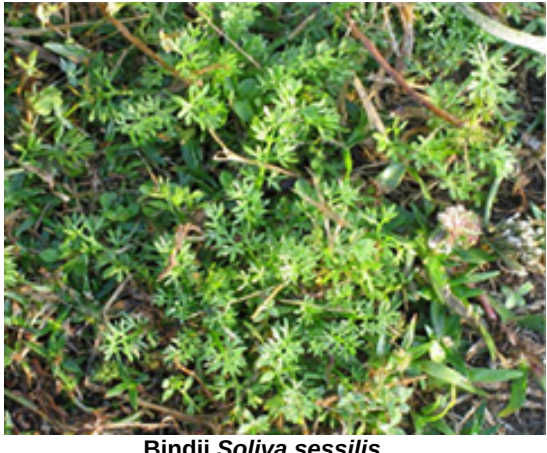
Bindii Soliva sessilis

multitude of culinary uses. The flowers are used to make dandelion wine, the leaves can be eaten, cooked or raw in various forms, such as in soup or salad. They are probably closest in character to mustard greens. Usually the young leaves and unopened buds are eaten raw in salads, while older leaves are cooked. The roots when baked and ground into powder are used to make a coffee substitute. Thanks to their deep stubborn roots and the fun blowing round balls containing hundreds of seeds, the Dandelion has all but infested the fringe areas of our Resort. Perhaps we should try making them useful and harvesting them.