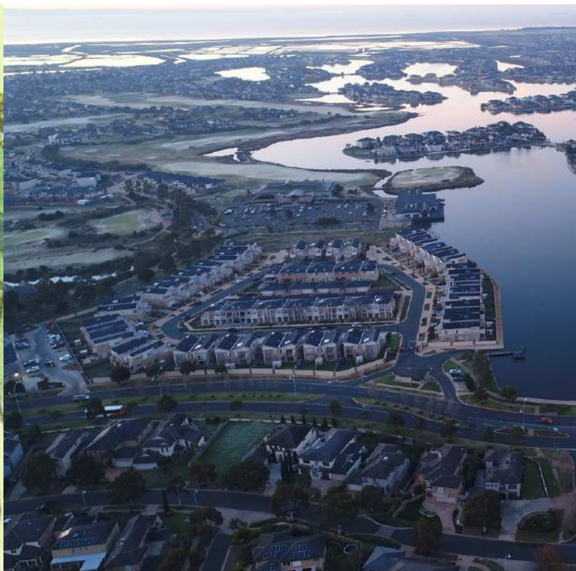
(FROM MASTERPLAN TO REALITY IN TWENTY-TWO SHORT YEARS)